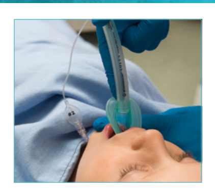
Airway Management • Airway Devices