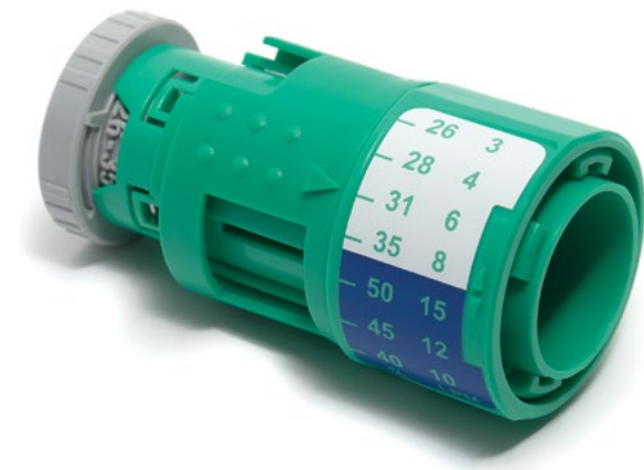
Table shows total flow rate delivered to patient in litres per minute (L/min)

Oxygen flow meter litres per minute (L/min)